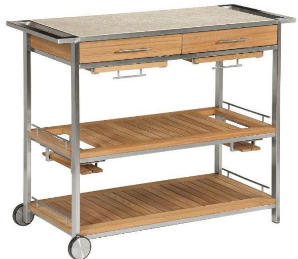
Mercury Serving Table with Italian Ceramic 'High Fired' Top in Frost (2MEMS.806)

Our products Equinox, Mercury and Monterey are made from 'high-fired' ceramic, which is made in Italy by Laminam, who specialize in producing superior surface materials. The Mercury serving table (2MEMS) is available with a ceramic top in Oxide .805, Frost .806 and Dusk .808. Please state your colour preference when ordering.