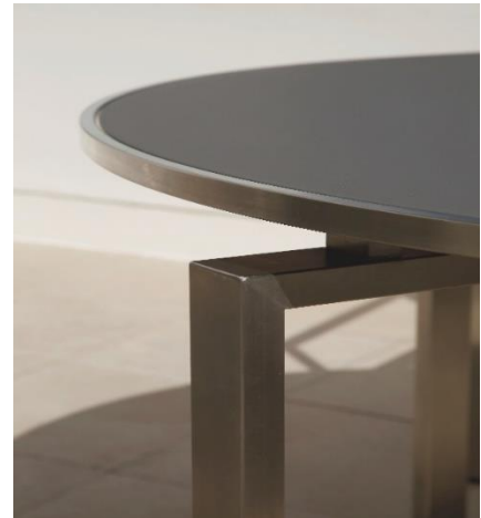
Mercury Table 120 with Tempered Glass Top in Platinum (2MEC12.605)