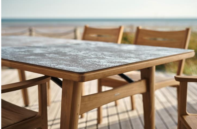
Monterey Armchair, x4 (1MTA.T) and Monterey Table 200 with Italian Ceramic 'High Fired' Top in Oxide (2MT20.805)

In addition to Teak, we offer table tops in Ceramic and Glass, with several colour options to suit your taste.