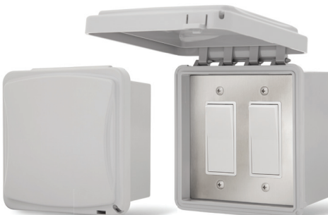
14-4425 Dual Surface Mount w/Weatherproof Box