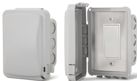
14-4410 Single Flush Mount w/Weatherproof Cover