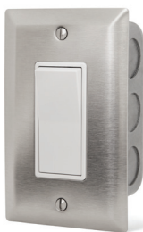
14-4400 Single SS Wall Plate w/Gang Box