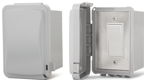
14-4420 Single Surface Mount w/Weatherproof Box