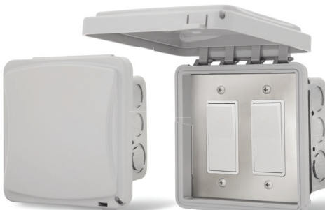
14-4415 Dual Flush Mount w/Weatherproof Cover