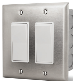
14-4405 Dual SS Wall Plate w/Gang Box