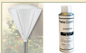
PC Cover Touch-Up Paint

PLEASE NOTE: Installation must conform to local codes and ordinances. Please check with local fire, code, or safety officials if you have any questions as to the suitability, legality, or acceptability of this heating appliance and proper storage of propane cylinders.