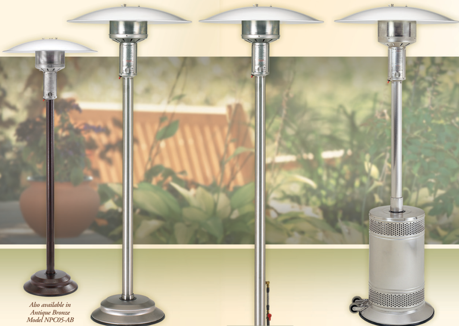
Also available in Antique Bronze Model NPC05-AB

Patio Comfort outdoor heaters are available for natural gas fueled residential and commercial installations. Our natural gas NPC05 models are constructed of the highest quality components for durability, maximum performance, safety, and long life. Our Model NPC05-AB (Antique Bronze) and SS (Stainless Steel) are the only natural gas patio heaters available that include a commercial quality U.S. Made "MB Sturgis" 12 foot steel-lined hose, two solid brass quick couplers, and solid brass safety shut off valve for added safety, portability, and convenience. The NPC05-SPP (Stainless Steel) permanent mount heater also includes a high quality installation kit with connector and gas shut-off valve.