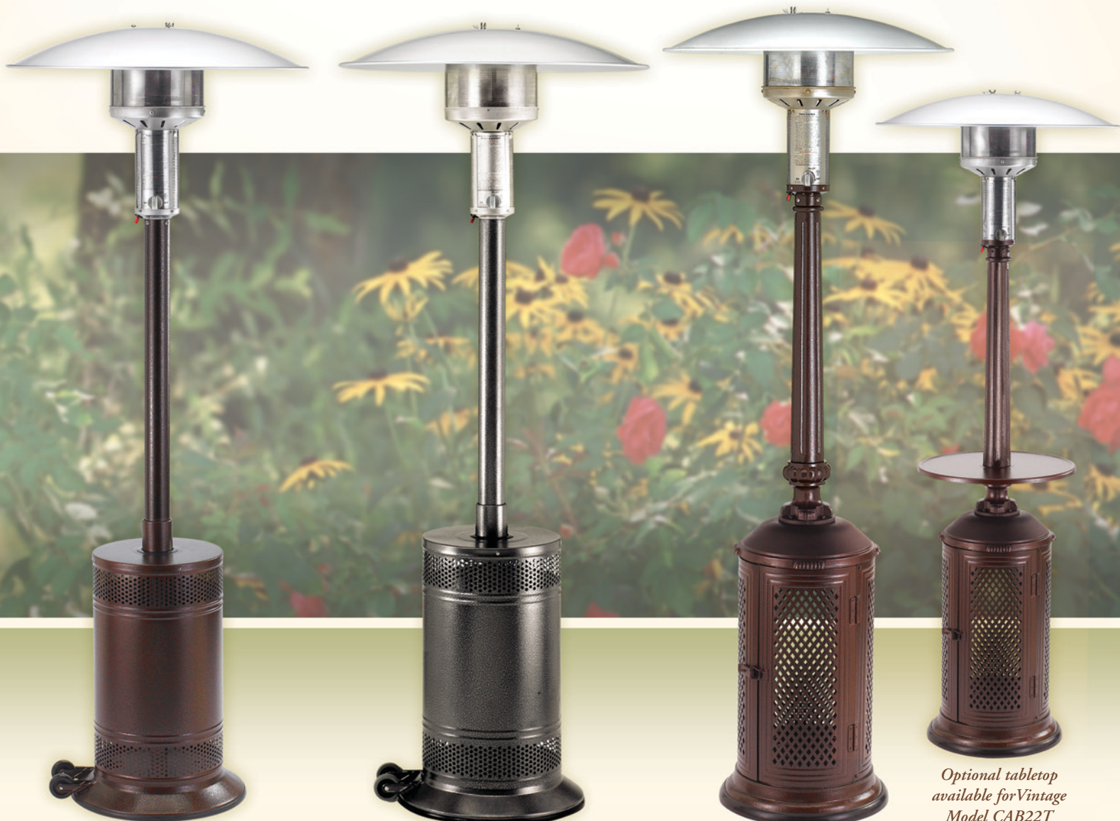
Model PC02-AB (Antique Bronze)