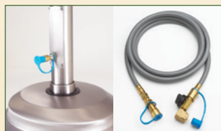
Hose Connector QD Hose & Shut-off Valve