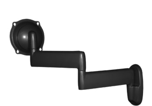
SB-WM32D Dual Arm Articulating Wall Mount 32" TV