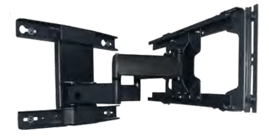
SB-WM46 Articulating Wall Mount 42-65" TV