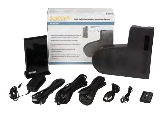
SB-HDWT HD Wireless Tranceiver System